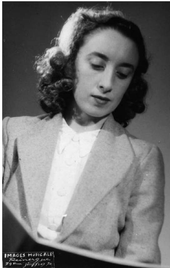
Figure 6. Jeanne Demessieux photographed for Images Musicales ([Paris]: Reinergue, probably December 1947), Municipal Archive of Montpellier, 4S20

Logistically, how did she fare in North America? All three of her transcontinental tours were organised by the New York firm Colbert-Laberge Concert Management, 90 who gave advance notice of her visit to organisers of organ recital series in a dignified brochure. The 1953 brochure featured an old publicity photo, probably taken at the time of her 1947 Salle Pleyel series, showing a demure young woman (albeit with long, shiny curls), her eyes lowered in examination of a score in her hands (see Figure 6); curiously, the score was cropped from the