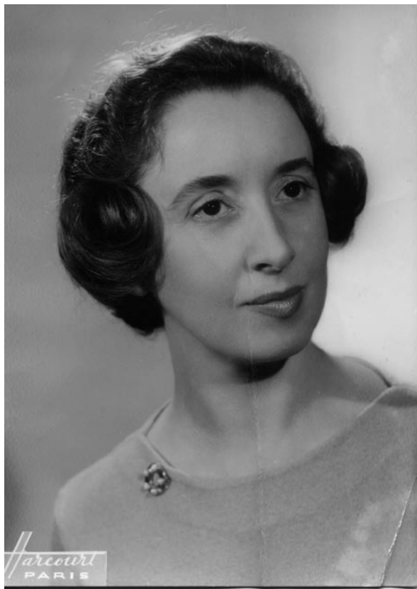
Figure 8. Jeanne Demessieux (Paris: Harcourt, ca 1960), Van Tuijl collection

According to Van Tuijl, it was characteristic of the Demessieux family to drive hard bargains in business negotiations. 105 Nothing in Jeanne Demessieux's personal correspondence indicates