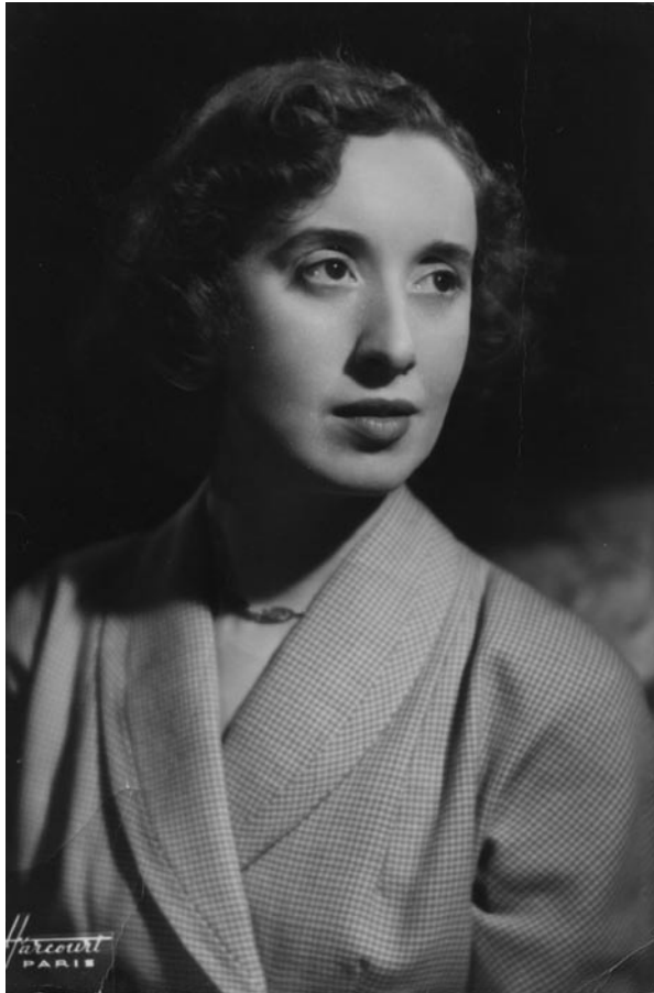
Figure 7. Jeanne Demessieux