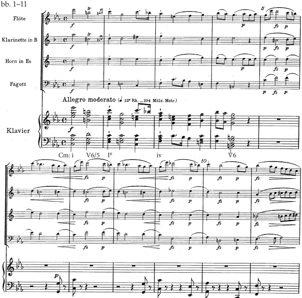
Example 2. Spohr, Quintet for Piano and Winds in C minor, op. 52, mvt I: Allegro moderato,

that grows out of a restatement of the main theme. Example 2 includes the original version of the main theme; Example 3 is the beginning of the transition. The abrupt harmonic shift in bar 23 engenders forward-looking sensitivity, but the music in G-flat Major expresses stasis—the composing out in time of a single moment. The key change is motivated by a half-step shift in the main theme—the first violin's G-natural in bar 4 becomes G-flat in bar 23. The passage in G-flat recalls previously heard melodic material in a distant key area. The harmony is subsidiary to the melodic change. Tonic and dominant harmony oscillate in a prolongation of G-flat Major that arrests forward harmonic motion. Return from the distant key area creates a two-measure internal phrase expansion. The parallel passage (bb. 5–12) occupies eight measures, while the digression to G-flat Major takes ten. After the turn towards G-flat minor in bar 28, V/III gradually emerges as the harmonic destination. Importantly, the harmonic way-finding does not disturb the two-bar repetitions of melodic material; Spohr eschews fragmentation and melodic liquidation. A classically standard transition resumes with a sudden change of texture in bar 33. In total, the harmonic digression can be understood as a parenthesis—a commentary not participating in, but placed alongside of, the main argument of the movement.