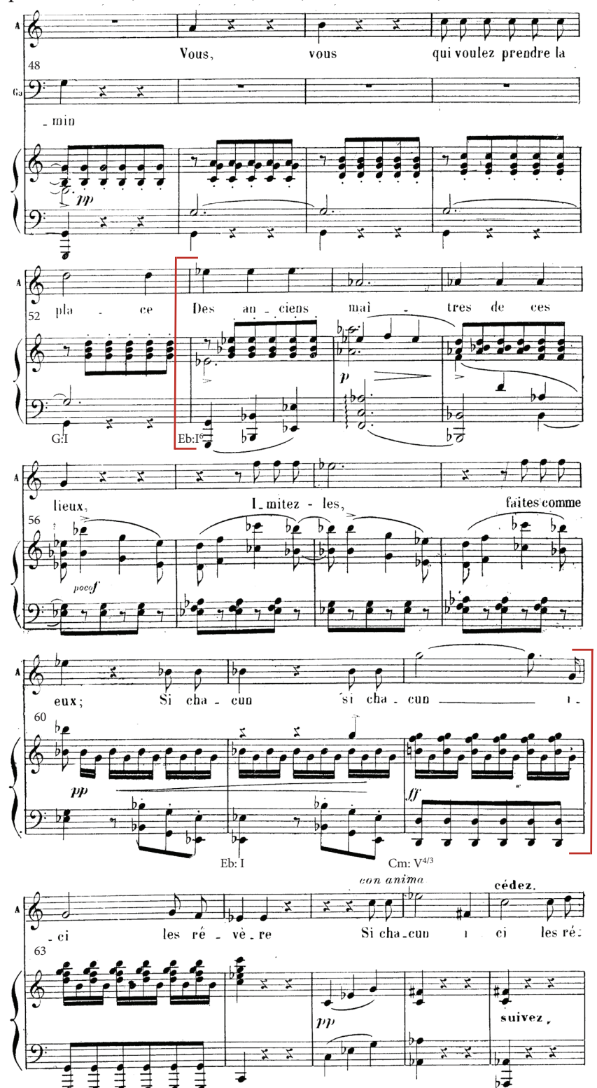
Example 17. Boieldieu, La dame blanche, Act II, no. 7: Duo et Trio, bb. 48-67