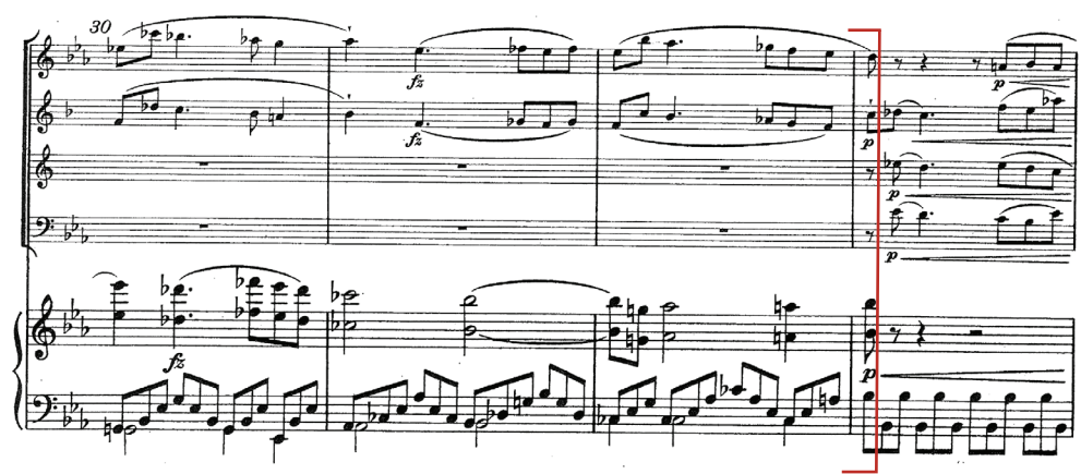
harmony drives towards Eb:V, melody keeps 2 m. motive

Describing this passage as a parenthesis invokes the critical framework of narratology—the notion that music tells a story. Audiences in the 1830s were comfortable hearing stories without words, not only in the context of programme music by the likes of Berlioz, but in the more widespread middlebrow genre of programmatic fantasies. Chopin's interest in musical narrative extended beyond allusions to topics or genres not indicated by the piece's title, such as a hymn within a nocturne (op. 15, no. 3), or a march within an impromptu (op. 36). Parakilas has shown how Chopin's development of the instrumental ballade relied on finding music analogues for specifically diegetic aspects of storytelling; the ballades do not merely represent the elements of a story (mimesis) but posit a narrator telling a story. Davis's recent work on the Romantic piano sonata—including Chopin's Sonata in B Minor, op. 58—describes how certain compositional decisions 'can also be understood as carrying heightened expressive significance within a Romantic aesthetic environment that relies on a fragmented sense of narrative temporality to create novelistic effects.' He goes on to state that: