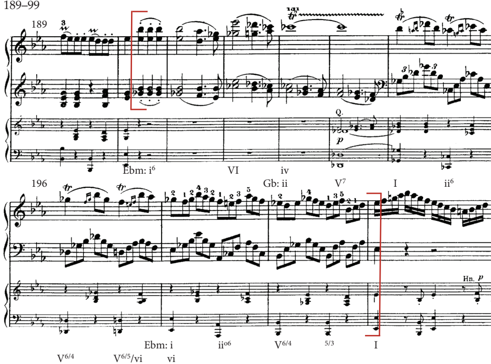
Example 4. Beethoven, Piano Concerto No. 3 in C minor, op. 37, mvt I: Allegro moderato, bb.

More generally, Beethoven's digressions differ from this example by Spohr in how they are integrated with their surroundings. The passages that Karol Berger describes as episodes of 'absent-mindedness'—for example, the shift to E Major in the last return of the rondo theme in op. 7, movement IV, or the F Major digression in the last movement of op. 2, no. 2 (see Ex. 5)—begin with a moment of rupture, contain melodic-thematic elements, and end with a process of finding their way back to the correct key.<sup>33</sup> The process of returning home nearly always features fragmentation and melodic liquidation—elements that imply formal 'loosening' or are marked in a functional sense as transitional.<sup>34</sup> Those transitional measures seem to compensate for the digression, rationalising it and joining it more closely with the main argument of the music. Rothstein describes this tendency, stating: