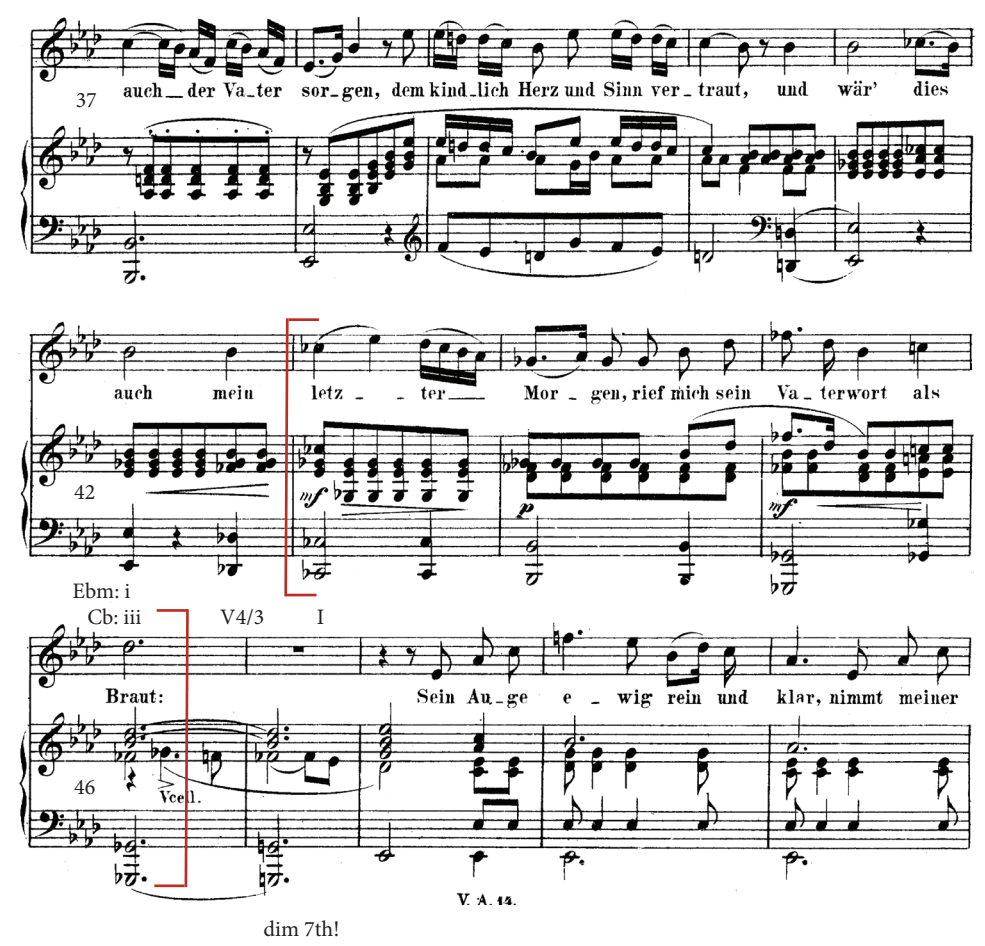
Example 20. Weber, Der Freischütz , Act III, no. 12. Cavatina, 'Und ob die Wolke sie verhülle,' bb. 37–50

narrative detailed above. La dame blanche and Der Freischütz were exceptionally popular works. Der Freischütz was staged in all the major cities of Europe and even reached New York and New Orleans by 1826. Scenes from Boieldieu's story decorated omnibuses in Paris between 1828 and 1855; the opera received its thousandth performance at the Opera-Comique in 1862. In the same way that Davis views non-normative events in Chopin's sonatas in dialogue with Classical-era conventions, certain harmonic techniques can be read in dialogue with opera. For a musical public, ready to hear stories in sound, text provides a cipher.