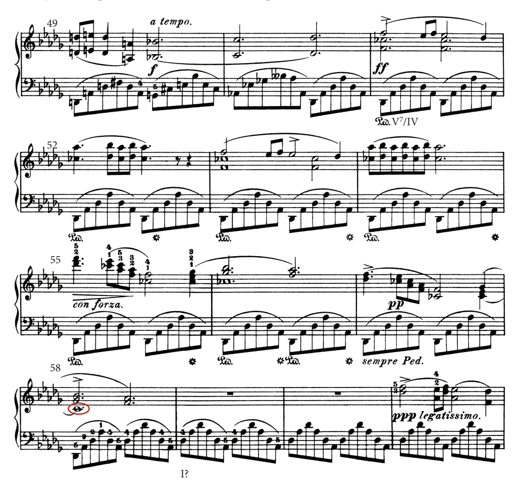
Example 6. Chopin, Nocturne in B-flat minor, op. 9, no. 1, bb. 49-61

The way Chopin exits the parenthesis takes Spohr's idea one step further. Spohr returns to the main argument of his sonata form through sequential harmonies, and a two-bar internal phrase expansion; he avoids the Beethovenian fragmentation and liquidation. Chopin's return is as abrupt as his departure. This lack of a phrase-expanding, finding-our-way-back passage leaves the D-Major door open. Chopin reinforces this feeling with three repetitions of this eight-measure phrase. The luminous, accented B-natural from bar 24 returns (spelled C-flat) as a scrupulously unresolved chordal seventh in bar 51 (see Ex. 6). The Nocturne's coda attempts to force C-flat into the conventional tonal hierarchy, resolving downward to the tonic. It fails to exorcise the revenant completely, with C-flats insistently returning and several not resolving in their own register (see Ex. 7). Chopin keeps the memory of the harmonic digression alive, a subtle tension between the rational and irrational remaining in the listener's mind after the final chords.