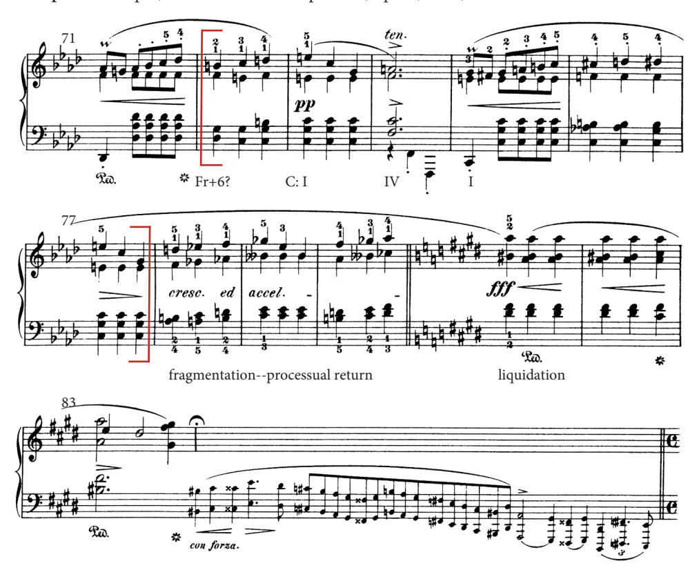
Example 13. Chopin, Nocturne in C-sharp minor, op. 27, no. 1, bb. 71–84

Parenthesis in later works occurs at bar 72 in the Nocturne in C-sharp minor, op. 27, no. 1 (see Ex. 13), from 1835, and at bar 16 in the Fantasy in F minor, op. 49 (see Ex. 14), from 1841. The elements of the Spohr-modelled parenthesis are present—restatement of material in a distant key, lack of a pivot chord, motivation by melodic variant, tonicisation not confirmed by a cadence and oscillating harmonies. In the Nocturne, a notably Beethovenian piece, exit from the distant key area comes through several measures of fragmentation and melodic liquidation. The parenthesis in the Fantasy creates a somewhat different effect because of its close integration to its phrase; it leaves the phrase rhythm of the previously stated prototype unchanged. The single line leading to C-flat is a comparatively smooth way to introduce the distant key. The feeling of harmonic rupture is dependent on the expectation generated by the three previous, diatonic iterations of the same material. The parenthetic world of E major seems more distant because of the force with which Chopin drives the music back to the tonic.