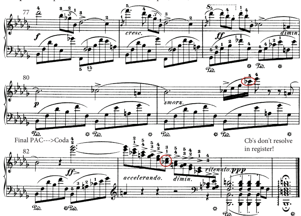
Example 7. Chopin, Nocturne in B-flat minor, op. 9, no. 1, bb. 77–85

Chopin performed Spohr's quintet in September of 1830, shortly before leaving Poland forever. He began composition of the op. 9 Nocturnes, two of which feature a version of Spohr's parenthesis, during his stay in Vienna from October 1830 to July 1831, though they were not published until 1832.<sup>39</sup> Though many of Chopin's early works feature colourful harmonic moments and daring modulations, nothing that Chopin composed before 1831 features a parenthesis of the type found in Spohr's piece. The particular balance of an exotic tonicisation accessed through a harmonic rupture that entered Chopin's vocabulary in 1830 to 1831 resonates conspicuously with Spohr.